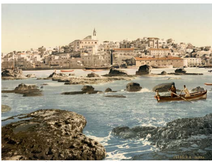
Port of Joppa (Jaffa); image in the public domain